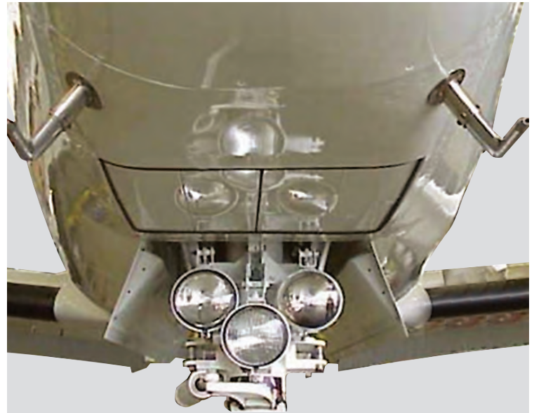
Extended nose with EO/IR camera stowed